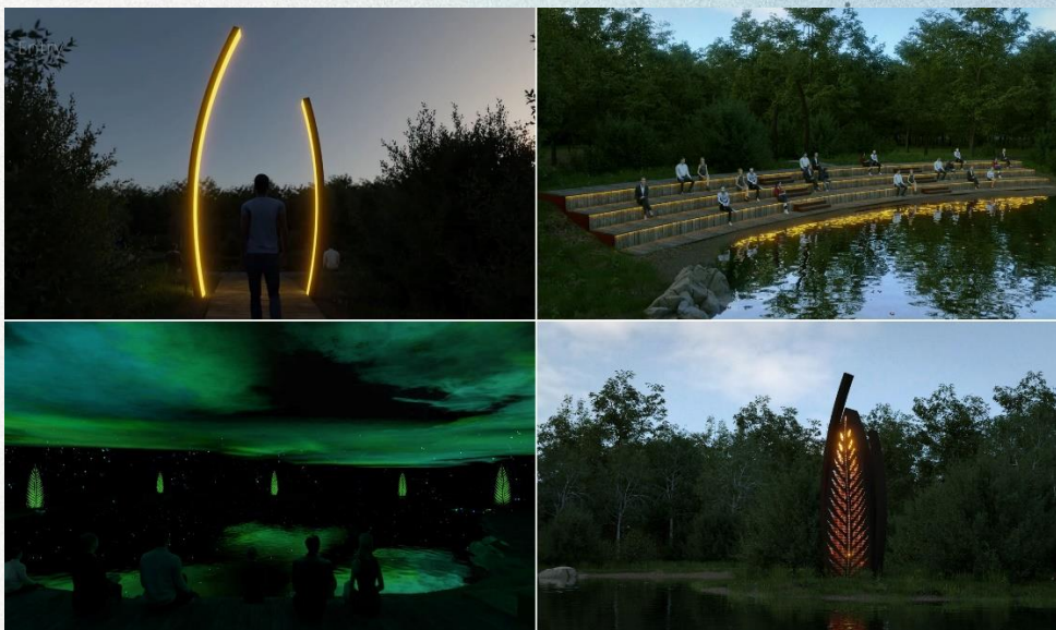
Guests will experience Illumina from a sustainably built amphitheatre, constructed in line with the resort's strict environmental guidelines.